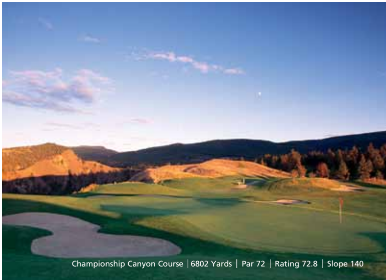
Championship Canyon Course | 6802 Yards | Par 72 | Rating 72.8 | Slope 140

Step up to Gallagher's Canyon, an elevating golf experience.