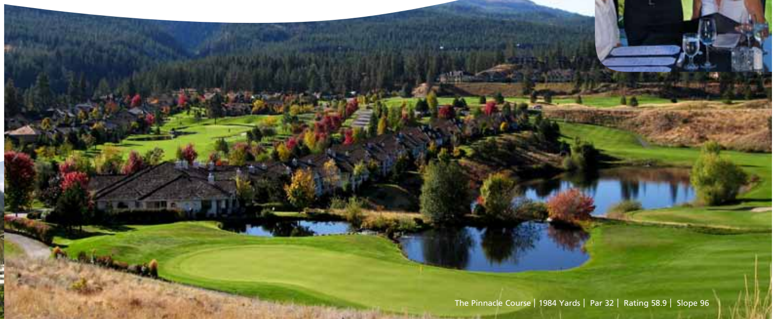
The Pinnacle Course | 1984 Yards | Par 32 | Rating 58.9 | Slope 96